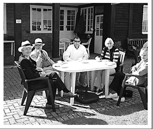
OVA News Summer 2012

... but they seem more intent on enjoying a cup of tea! What could be more British, – including summer sunshine perhaps?