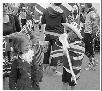
Even the verges ditches and hedgebanks came out in red, white and blue for the colourful weekend.

The hot news (more exactly, cold and wet news) was the extreme rainfall of Saturday 7<sup>th</sup> July, following an unseasonably wet period with saturated ground, leading to flooding down the River Otter and several other West-Country rivers. Sadly, a number of low-lying properties were flooded, just after they were getting over the last soaking, an OVA member floated his car in South Farm Road, and the Budleigh Cricket Clubhouse looked a sorry sight, again. More from Mo over the page .