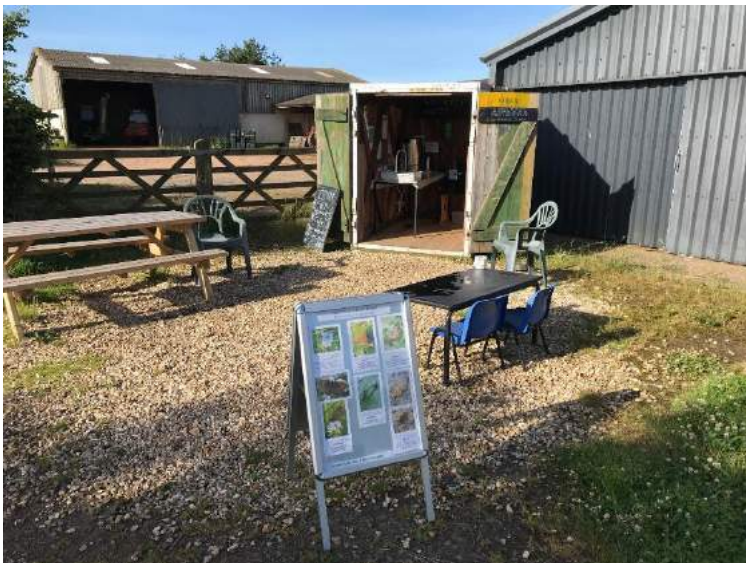
The new OVA information board at Stantyway