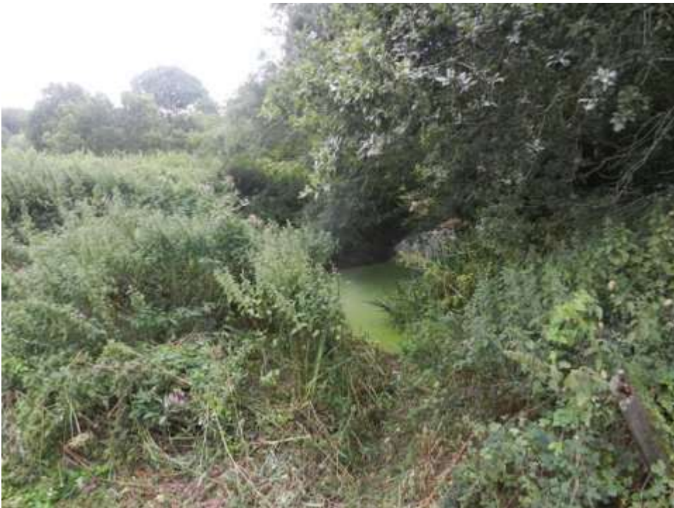
After 2 (before tidy up)