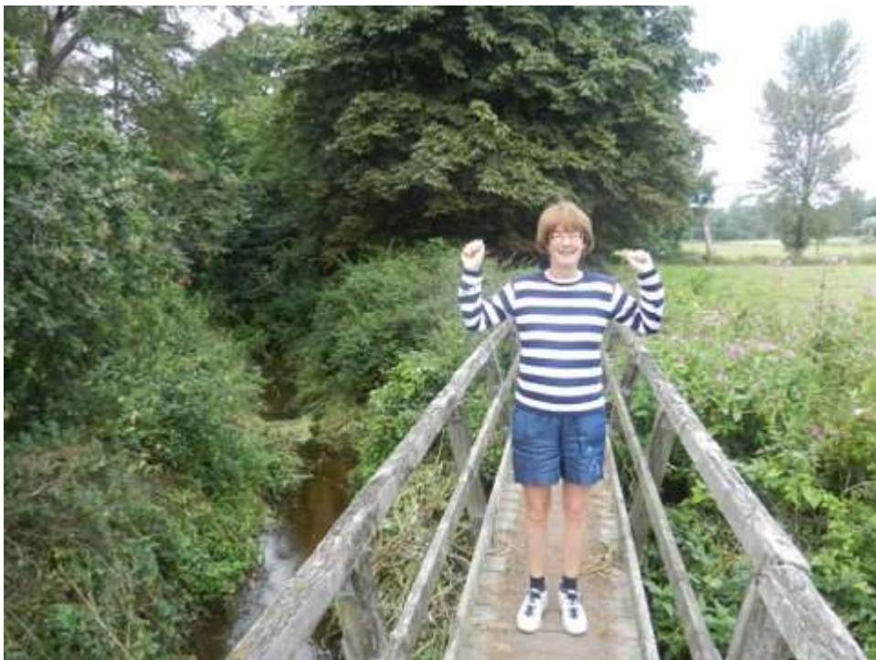
After 1 (left hand side)